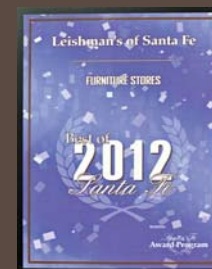
Voted #1 Santa Fe Furniture Store in 2012 by the readers of the Santa Fe Reporter.